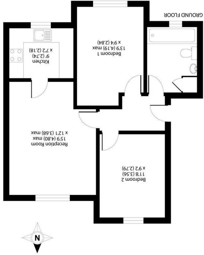
APPROX. GROSS INTERNAL FLOOR AREA 608 SQ FT 56.4 SQ METRES

34 Richmond Road Kingston upon Thames Surrey KT2 6ED www.gibsonlane.co.uk Tel: 020 8546 5444