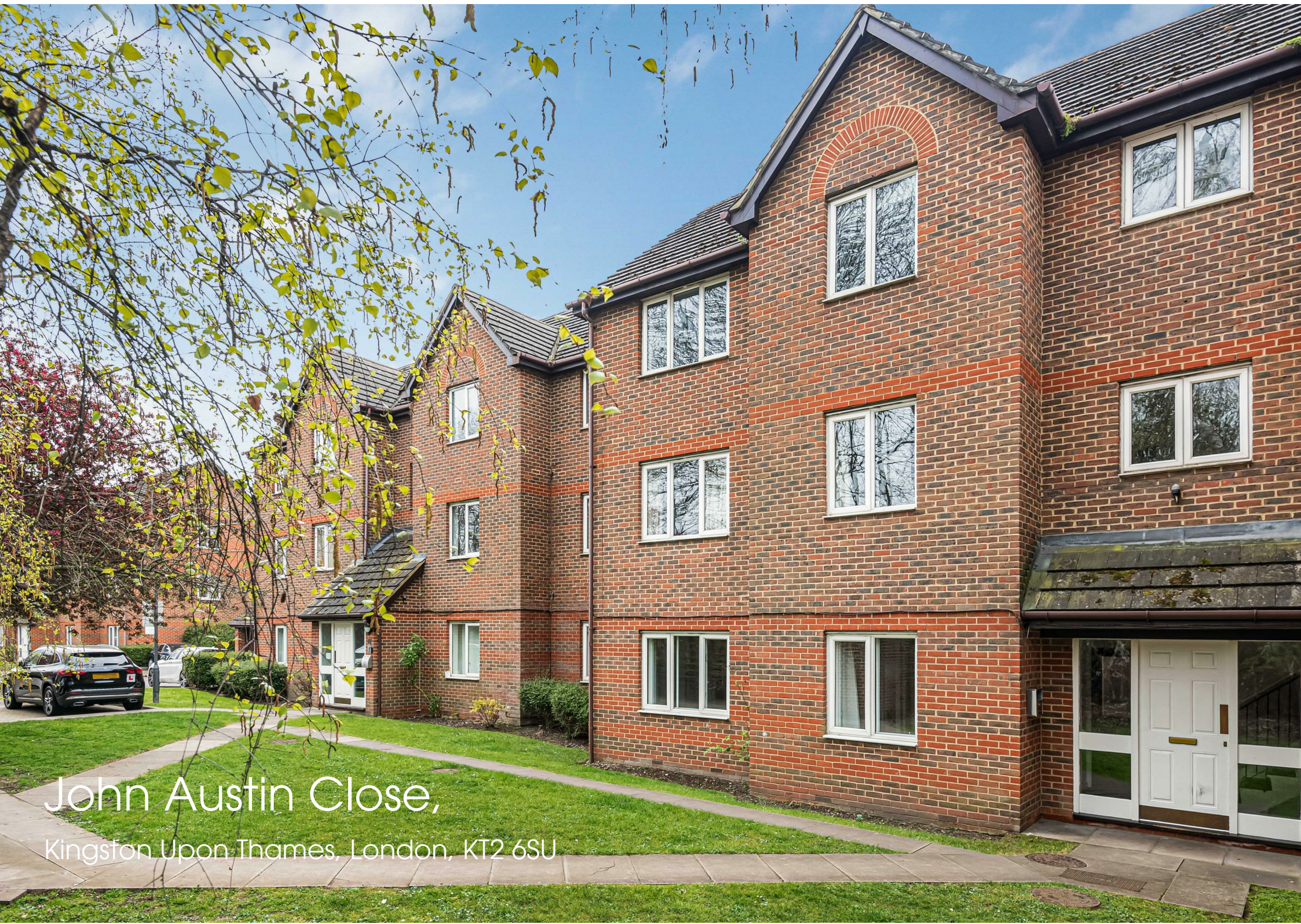
John Austin Close, Kingston Upon Thames, London, KT2 6SU